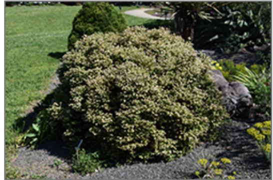
Darrow's Blueberry in bloom

This is a multi-stemmed evergreen shrub with a mounded form. Its average texture blends into the landscape, but can be balanced by one or two finer or coarser trees or shrubs for an effective composition. This is a relatively low maintenance plant, and usually looks its best without pruning, although it will tolerate pruning. It is a good choice for attracting birds to your yard. It has no significant negative characteristics.