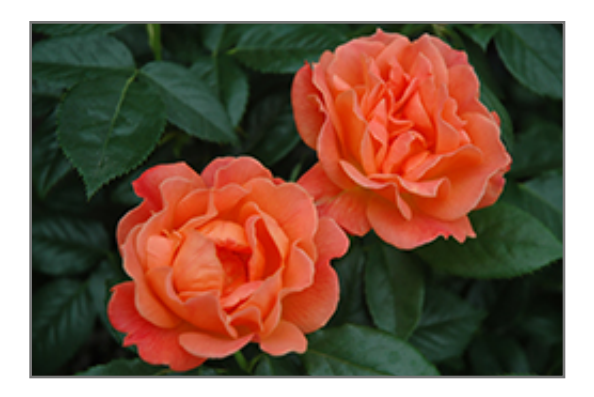
Livin' Easy Rose flowers