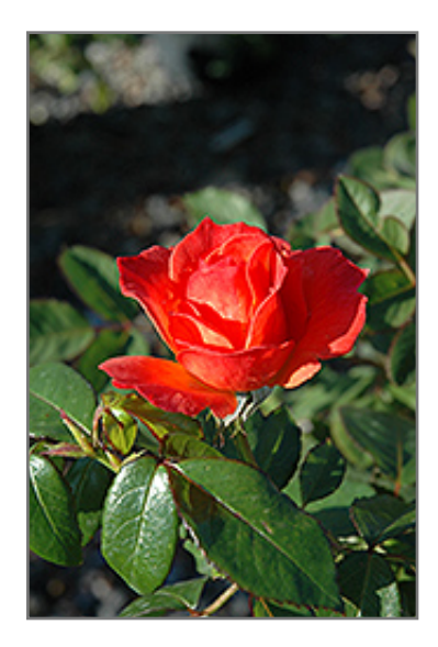
Livin' Easy Rose flowers