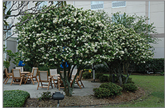
Japanese Privet in bloom

Japanese Privet is recommended for the following landscape applications;