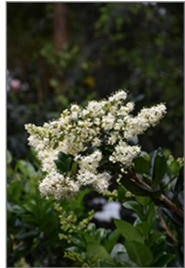
Japanese Privet flowers