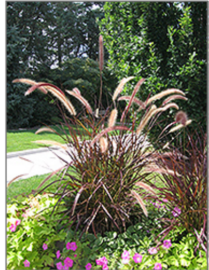
Red Fountain Grass flowers

Red Fountain Grass is recommended for the following landscape applications;