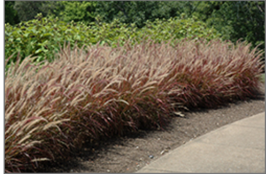
Red Fountain Grass in bloom

Red Fountain Grass will grow to be about 4 feet tall at maturity, with a spread of 3 feet. It grows at a medium rate, and under ideal conditions can be expected to live for approximately 10 years. As an herbaceous perennial, this plant will usually die back to the crown each winter, and will regrow from the base each spring. Be careful not to disturb the crown in late winter when it may not be readily seen!